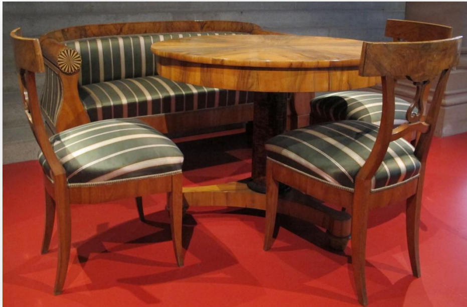
Image 1: Images shows off some of the Biedermeier period furniture

I will give my own opinion of what I think of the Biedermeier furniture and designs in this report with also referenced images of its work.