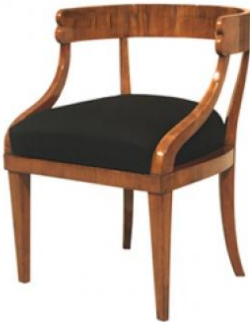
A Biedermeier rare chair. Cherry veneer. French polish finish. Austria, c. 1825-30