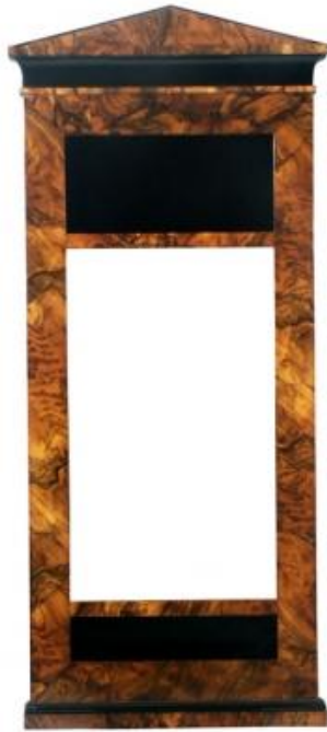
An elegant Biedermeier mirror. Walnut veneer. Ebonized details.. French polish finish. Austria, c. 1825-30 Height: 57 inches, Width: 23 inches, Depth: 1.6 inches