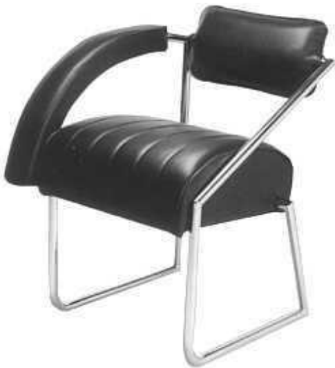
The Nonconformist Chair