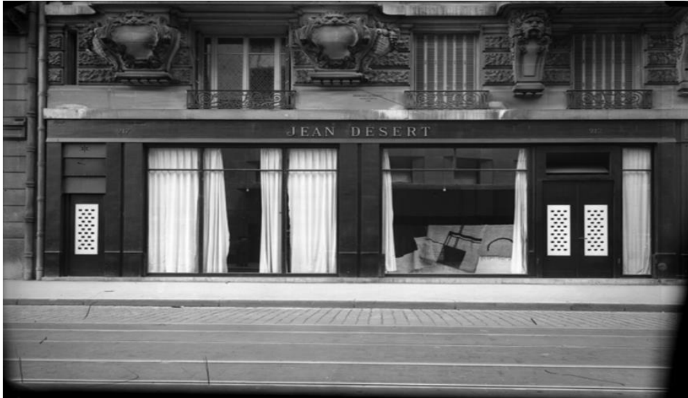
Jean Désert at 217 rue du Faubourg Saint-Honoré