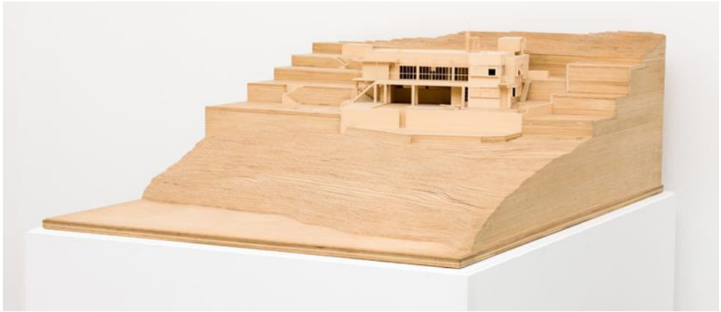
Scale model of house