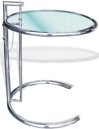
E1027 Eileen Gray table