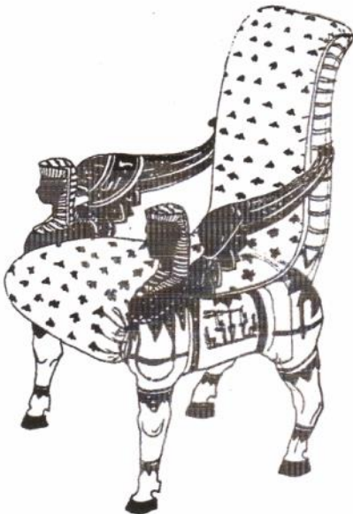
Empire Chair made in Egyptian style