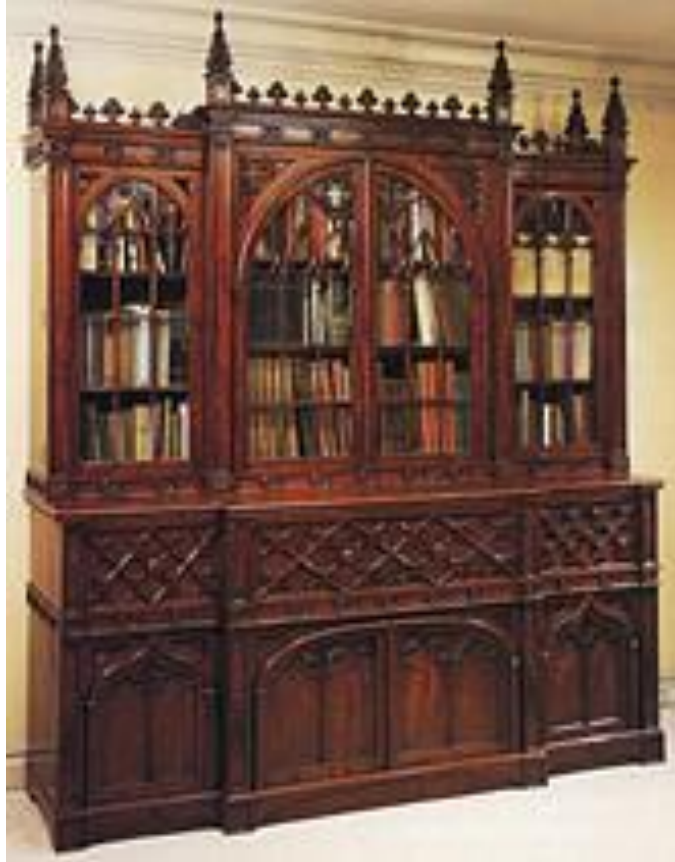
Gothic style Bookcase