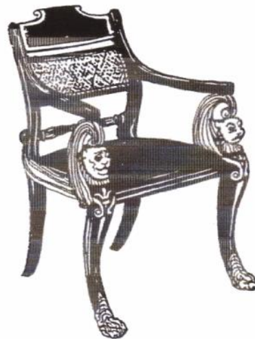
Armchair painted bronze green & gilded