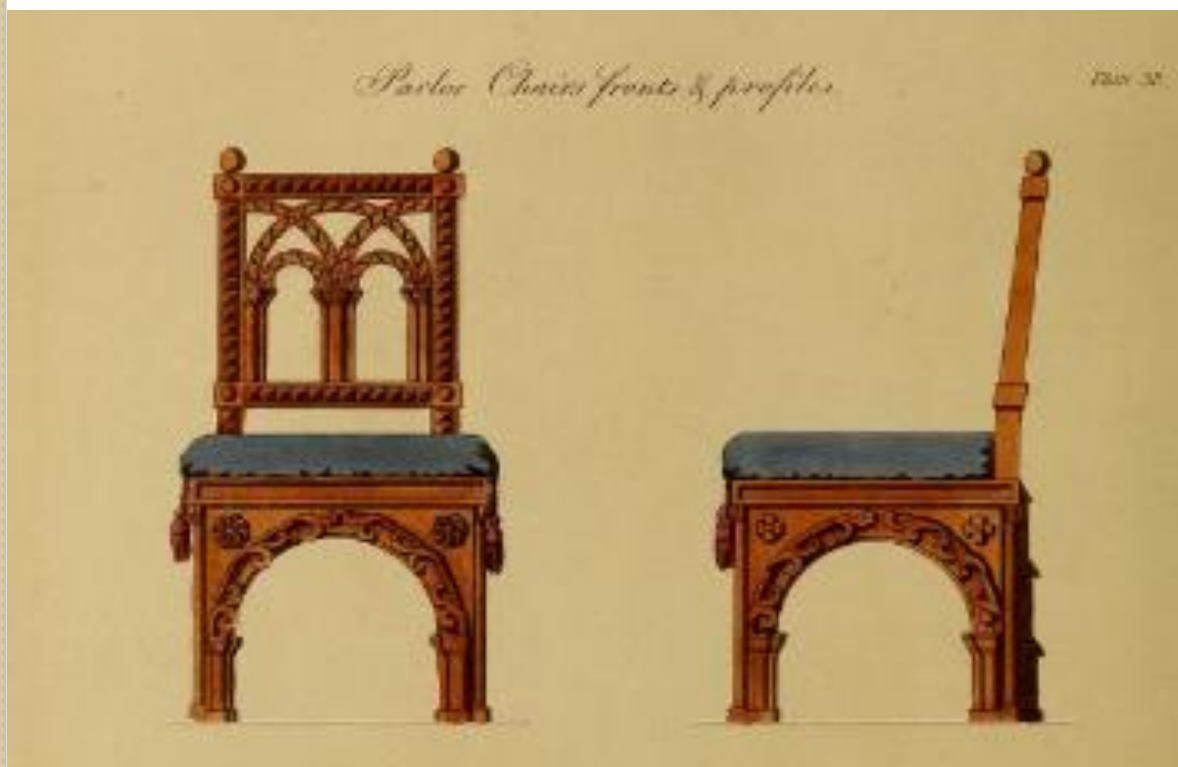
Gothic Style Chair from his book