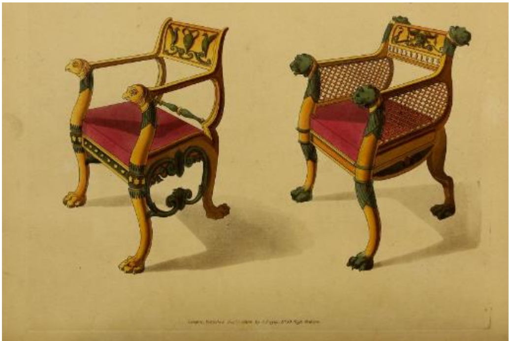
Egyptian style chairs from his book