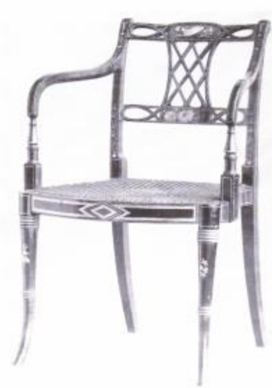
Lattice back chair