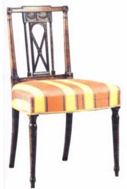
Lattice back chair