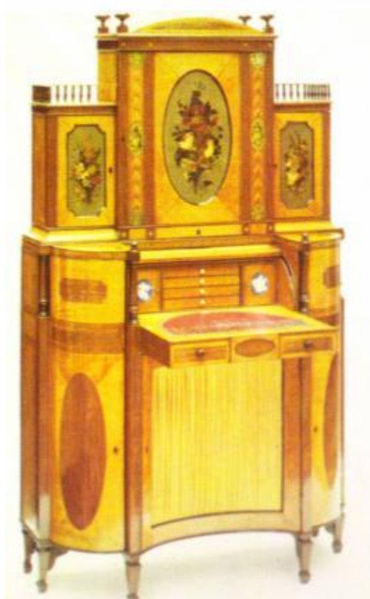
Ladies writing table