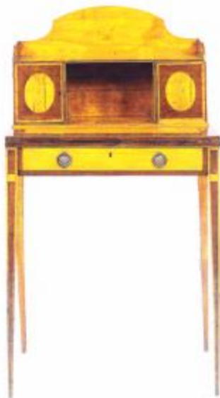
Bonheur –Du Jour Ladies writing table