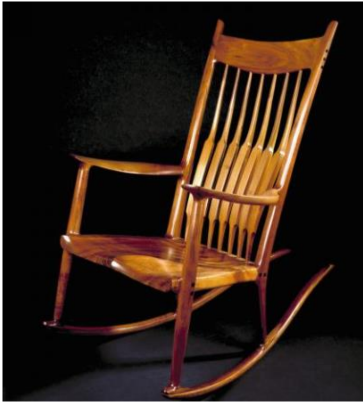
Walnut Rocking chair 1980