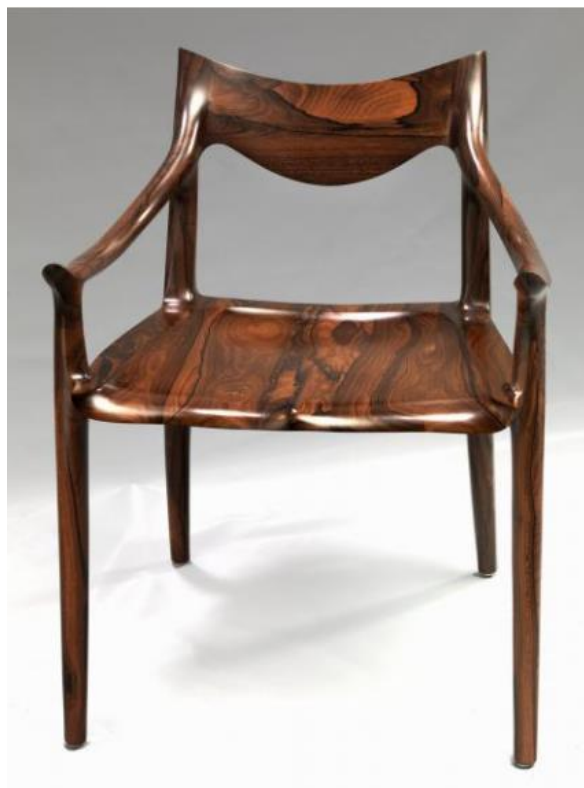
Ziricote and Ebony Side Chair 1995