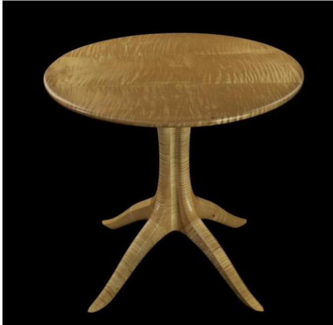
Maple Pedestal Table 1992