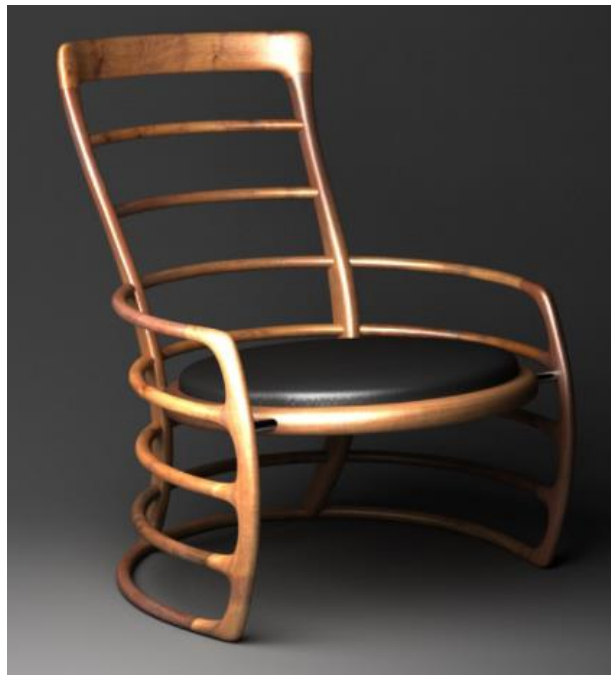
Chair 11 Scott Morrison Website