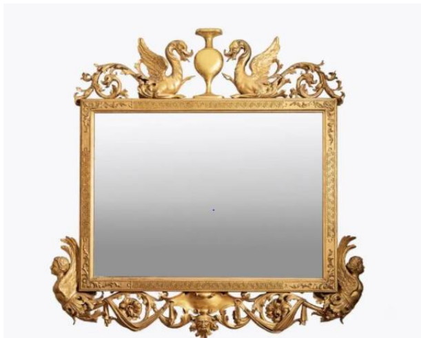
Figure 5 Hope Over Mantle Mirror

Figure 4 shows a Hope designed writing table which is a brilliant example of Regency period