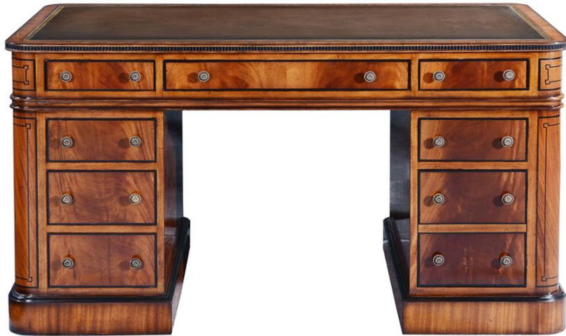
Figure 4 Hope Writing Desk/Image obtained from Brights of Nettlebed

Thomas Hope was a Dutch born Regency designer who was a major contributor in terms of interior design, architecture and furniture design to the Regency period. As well as his work designing furniture and interiors of stately homes, he also published numerous books on furniture design and architecture which are considered valuable documents and reference material relating to this period.