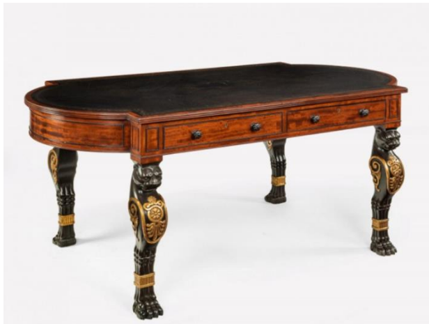
Figure 8 Regency Writing Table

another example of a writing table of the period with its distinctive monopodium legs. Note the use of mahogany and ebonised lines which give a 'grandeur' to the design. I personally don't like these grand, bold furniture pieces, but I admire