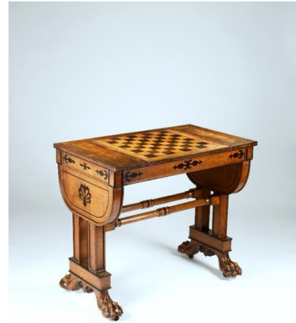
Figure 7 Backgammon Table

George Smith, born in London in 1786 was a cabinet maker, upholsterer and furniture design who produced books with detailed furniture drawings which were influential in allowing people to make Regency styled furniture. Figure 7 shows one such example of a backgammon board game table taken from a design from one of his books: 'A Collection of Designs for Household Furniture'. Figure 8 is