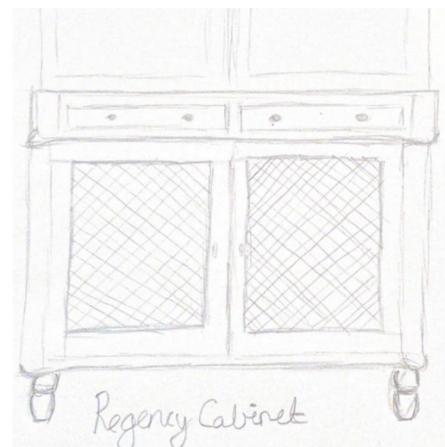
Figure 3 Door detail sketch.

and the straight legs show {sic} the influence of French furniture.' Figure 2 shows a magnificent example of a Henry Holland cabinet, again with prominent gilded parts and 'a strong chinoiserie style ( Chinoiserie , a French term, signifying "Chinese-esque", refers to a recurring theme in European artistic styles since the