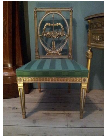
Figure 1 Regency Chair.

Henry Holland was one of the leading designers of the Regency period, although he was less well known than his contemporaries, due to his reluctance to court public attention as is evident by his comments to a friend in 1789: 'Pray no more public compliments to me. I began the world a very independent man and wish to hold it at arms length...I find myself already more the object of public notice than suits my disposition or plan of life' ("henry holland – The Country Seat", 2022). Carlton House in London and the Royal Pavilion at Brighton are two outstanding examples of the use of Regency Furniture, interiors and design which were carried out by Holland under Royal patronage and commission. Figure 1 shows a fine example of a chair designed by Holland and typical of the Regency period with its gilded frame and bow and arrowed back with 'square seat