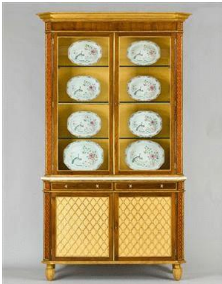
Figure 2 Regency Cabinet.

and the straight legs show {sic} the influence of French furniture.' Figure 2 shows a magnificent example of a Henry Holland cabinet, again with prominent gilded parts and 'a strong chinoiserie style ( Chinoiserie , a French term, signifying "Chinese-esque", refers to a recurring theme in European artistic styles since the